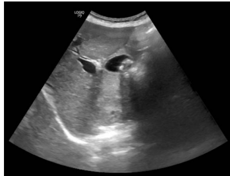
Figure 1 Abdominal ultrasound showed multiple stones.

Ultrasound is shown in (Figure 1 and 2). Gallbladder demonstrates multiple stones in the dependent portion with acoustic shadowing, and there is a tube seen at the fundus of the Gallbladder with the mild pericholecystic fluid collection, common bile duct (CBD) patient (1 mm).