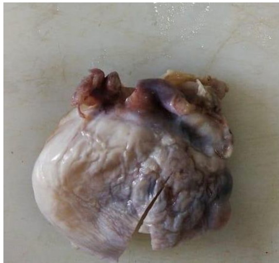
Figure 1 Dermoid Cyst

Uterus measuring 8 x 5.5 x 4 cm, slit like cavity identified. Cervix measures 2.8 cm in length while the right ovary was measuring 7.5 x 7 x 4 cm. On the cut section of the right ovary, grey, pultaceous material oozed out and hair identified. Solid cystic areas identified. Right fallopian tube measured 4.5 cm in length and the left ovary was measuring 7 x 6 x 3 cm. On the cut section of the left ovary, greyish pultaceous material oozed out. Hair, solid-cystic and calcified areas identified. Left fallopian tube was measuring 4.5 cm in length (figure 1).