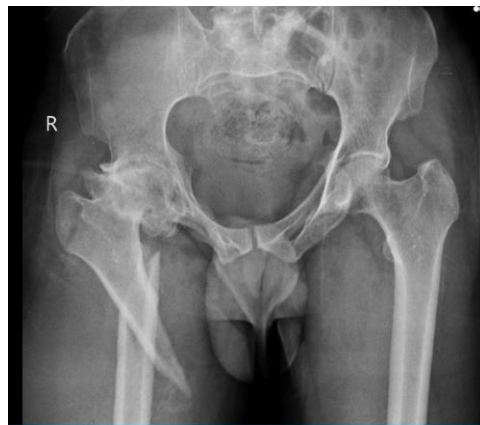
Figure 3 Pre-operative X-ray of both right leg showing sub-trochanteric fracture with osteoarthritis of right hip.