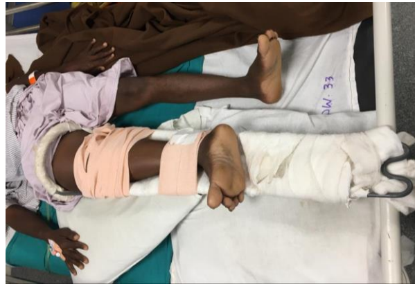
Figure 2 Pre-operative pic showing presence of Thomas splint on affected leg which is internally rotated.