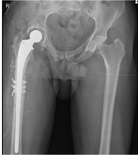
Figure 4 Post-operative X-ray of right leg post-operative showing standard modular cemented Femoral Long Stem in which Acetabular Cup is used in Total hip replacement.