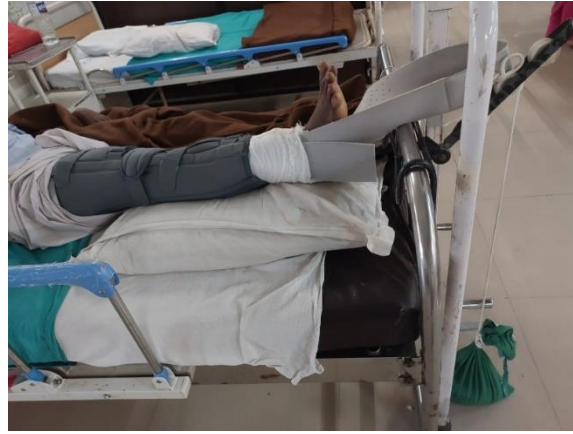
Figure 1 Post-operative picture showing presence of long knee brace with skin traction.