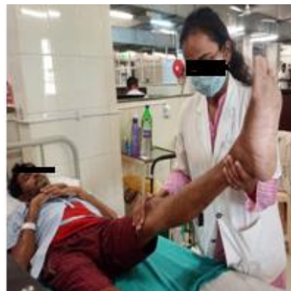
Figure 3 Active-assisted SLR is being performed on the patient.