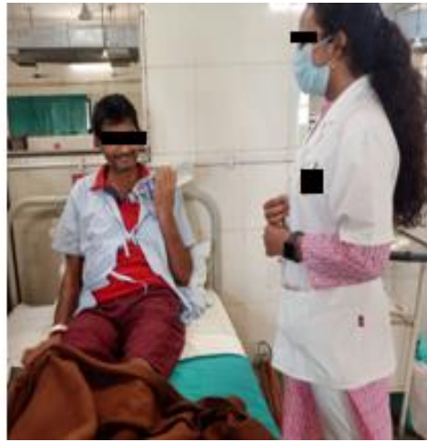
Figure 1 The patient is performing upper limb strengthening exercises.