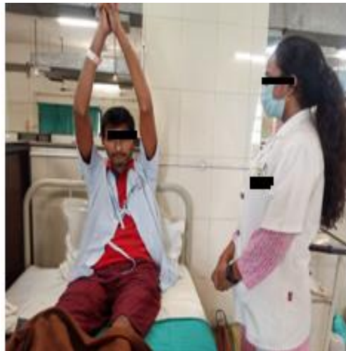
Figure 2 Breathing exercises are performed by the patient for maintaining good ventilation.