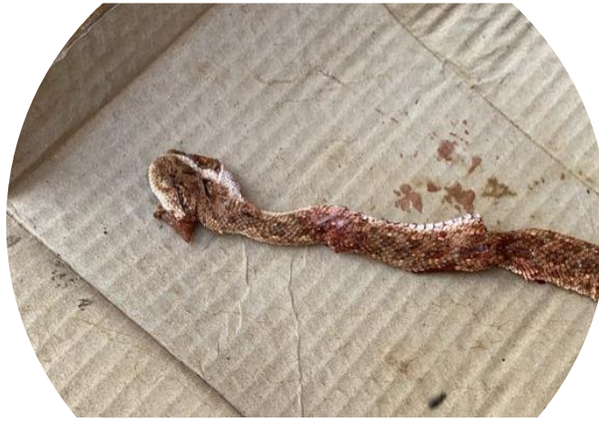
Figure 1 Vipera berus snake

given anti-venom. The venom causes cytotoxic, hemotoxic, and neurotoxic consequences, which require different interventions. Managing acute and chronic complications can enhance the outcomes of patients exposed to snakebite (Russell et al., 2021). However, the present case experienced unusual complications with an old female presented with a snake (Vipera berus) (figure 1) bite.