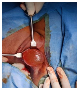
Figure 2 Meticulous dissection of cystic hygroma along with its excision in toto.