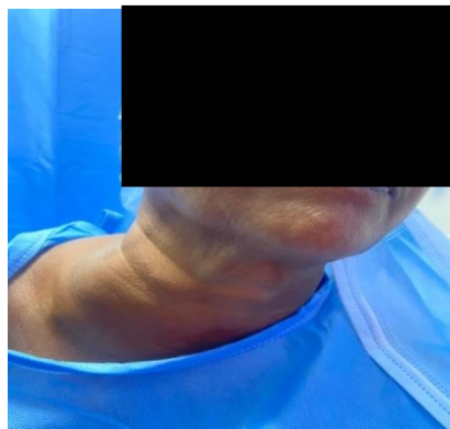
Figure 1 Swelling on the right anterior and posterior aspects of the neck in this pre-operative photograph.