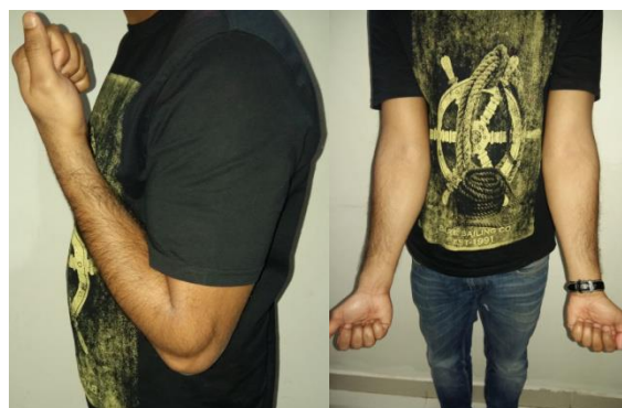
Figure 3 follow-up clinical photographs at 12 month