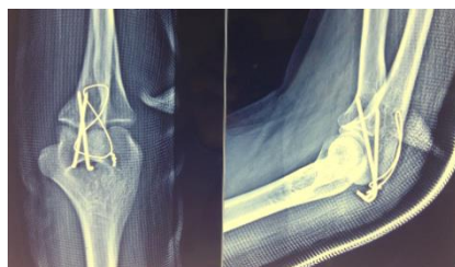
Figure 2 (A) Immediate post-op X- ray

The procedure was performed while wearing a tourniquet. The affected elbow was exposed by a curvilinear incision on the back, the damage site was identified, and the hematoma was evacuated. The Triceps tendon along with flack of bone was found retracted approximately two cm proximally from the tip of olecranon. The bony flake attached with triceps tendon, was reduced and stabilized using two k-wires later for reinforcement tension band wiring done (Fig-2A). After surgery, the arm remained immobilized in a posterior above elbow slab at eighty degree of flexion for three weeks before beginning active flexion. After six weeks, active extension was initiated (Fig-2B). Three months following the procedure, the k-wires were removed. After six months, the patient's left elbow had regained its entire range of active movement and muscular strength. Complete recovery and full muscle bulk observed after 1 year (Fig-3).