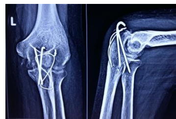
(B) Follow-up X-ray at 6 weeks