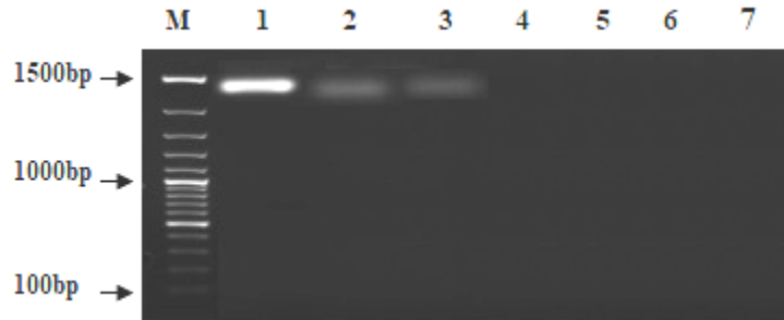
Figure 2 Ethidium bromide stained agarose gel (1%), PCR was carried on camel sera positive to RBPT. M: 100bp ladder, lane 1: control +ve, lane 2 and 3 positive test samples, lane 4,5,6,7 negative samples.