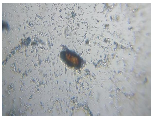
Figure 3 Egg of Ascaris lumbricoides