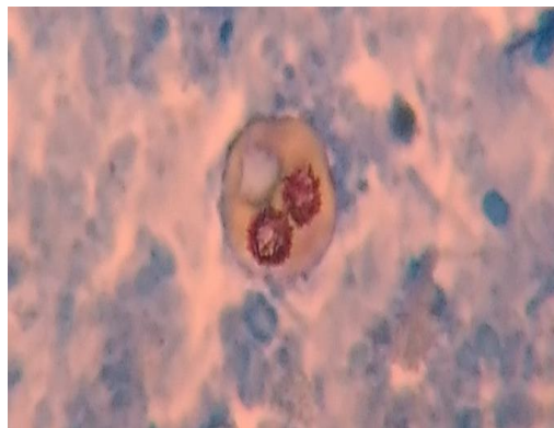
Figure 2 Cyst of Entamoeba