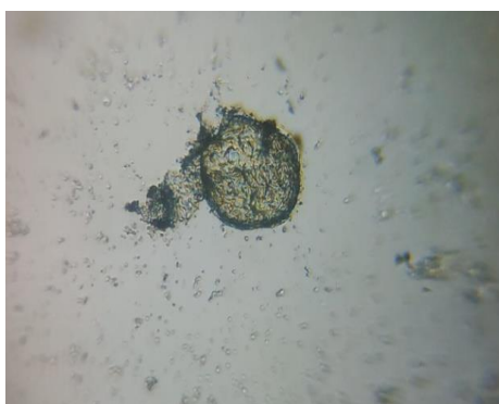
Figure 4 Egg of Ascaris lumbricoides