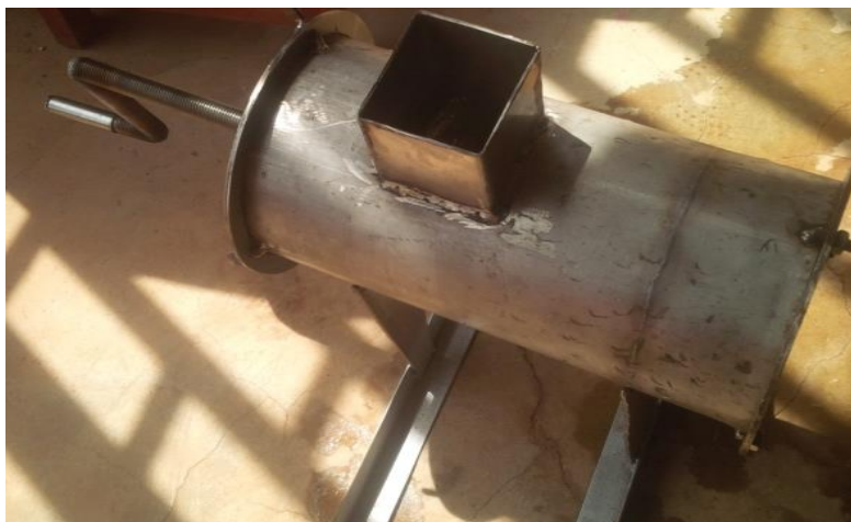
Figure 1 Pictorial View of the Juice Extractor

The machine (Figure 1) works based on the principle of shearing and compressive operation. During the operation of the extractor, the materials (citrus fruits) to be press is weighed using weighing balance and then introduced into the cylindrical cage already fixed on the frame through the hopper. The turning handle will then be used to screw the shaft through a nut and thereby shearing and compressing the fruit between the plates in the cage. When the extraction operation has been completed, the cake/chaff can then be extruded by losing the screw.