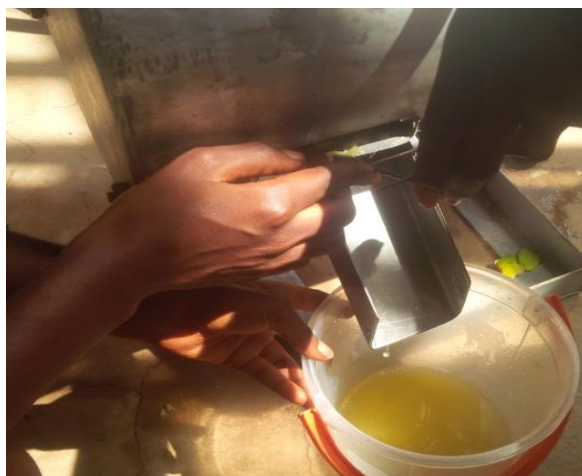
Figure 2 Pictorial Views of the Juice Extractor during Testing of the Extractor