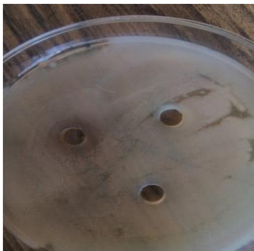
Figure 1: Microbial susceptibility test showing inhibition zone in E. coli