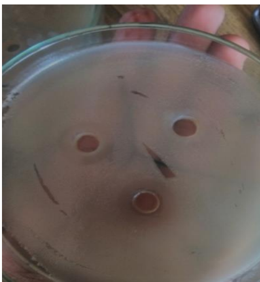
Figure 2: Microbial susceptibility test showing inhibition zone in S. aureus