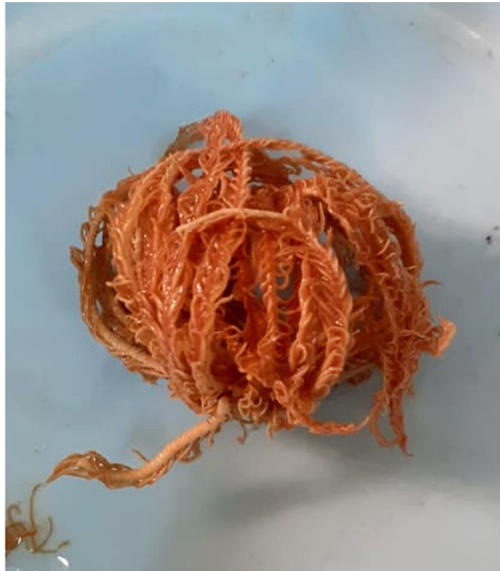
Figure 1 Comanthus wahlbergii (Müller, 1843)