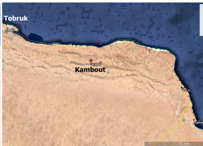
Figure 2: Map of Kamout district.