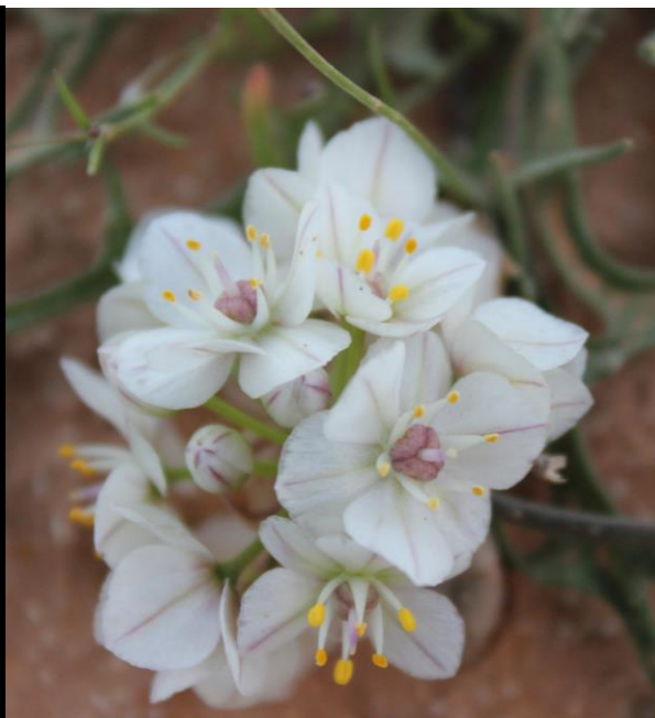
Figure 4: Allium blomfieldianum . flowers