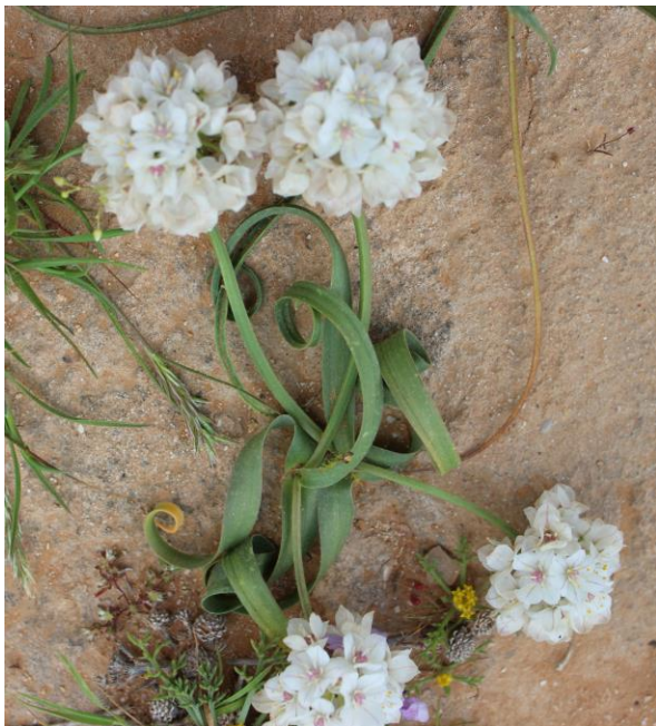
Figure 3: Allium blomfieldianum . habit