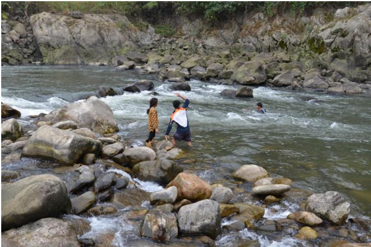
Figure 3 Type locality of Garra tamangi , Dikrong River at Hoj, Arunachal Pradesh, India.