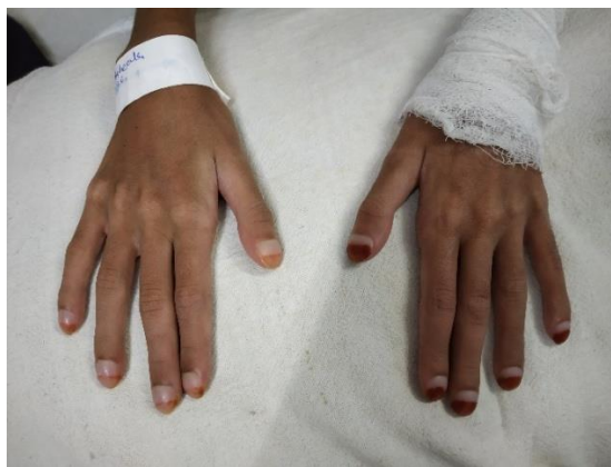
Figure 2 Showing grade II clubbing of nails (obliteration of Lovibond angle)