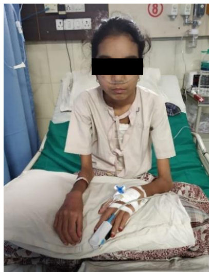
Figure 1 Lean body mass (difficulty in gaining weight)

On observation, her body built was ectomorphic (fig 1), eyes and sclera were protruded and teeth were retrognathia. The patient's nails were yellowish in colour and clubbing was present (fig 2). On examination, she was alert and oriented to time, person, and self, febrile at 98°F. Heart rate-76 beats/min, BP-116/80 mm/Hg, tachypnoeic at 26 breaths/min, and O 2 saturation at 95% maintained by nasal mask. On inspection, the chest movement is reduced on both sides with an increase in the work of respiration due to greater activation of accessory muscles. On palpation, chest excursion confirmed the decreased chest expansion on both sides. Chest auscultation revealed bilateral symmetric expansion, air entry was reduced in upper zones and crackles were present.