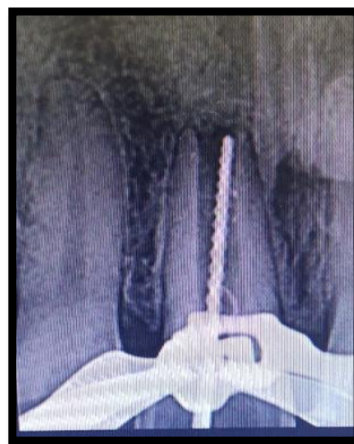
Figure 3 Working length determination