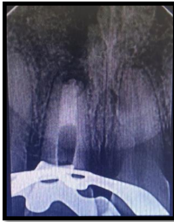
Figure 4 MTA apical plug