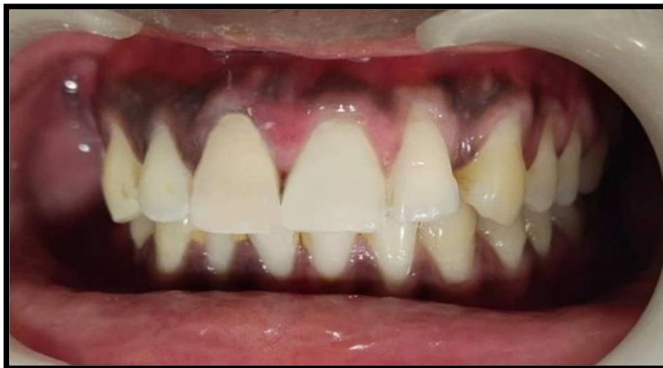
Figure 6 Metal ceramic crown in 11 to mask the discolouration