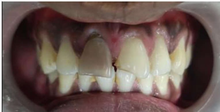
Figure 1 Discoloured tooth in relation to 11

A 23-year-old male patient approached with the major complaint of discolouration in the right upper front tooth with intermittent pain that had been bothering him for the last 3 years. The patient experienced a trauma that occurred 3 years ago. Past dental history revealed previously endodontic therapy was performed in relation to maxillary right central incisor (11) (Federation Dentaire International Tooth Numbering System) before 3 yrs. Clinical examination revealed discolored maxillary right central incisor (11) and Ellis Class II fracture in maxillary left central incisor (21) (Figure 1). An intraoral periapical radiograph revealed an incompletely developed apex with a radiopaque filling material present in the root canal with thin dentinal walls in the apical area in reference to the maxillary right central incisor (Figure 2). Pulp sensibility tests including electric pulp testing and cold test elicits non-vitality of tooth 11 and normal response in case of 21. The case was diagnosed as a discolored endodontically treated tooth with blunderbuss canal in 11. Considering the width of the apical foramen, the treatment strategy involved the removal of old root canal filling material and the induction of a calcified apical barrier using MTA (apexification). After notifying the patient, he gave his informed consent.