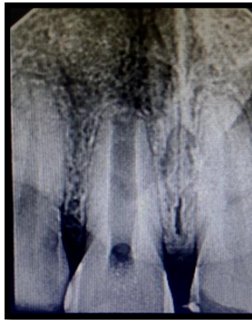
Figure 2 Radiograph showing the complete removal of guttapercha from the root canal in 11

The tooth was restored with a light cured composite material (Tetric N-Ceram, Ivoclar Vivadent AG, Schaan, Liechtenstein). For discolouration, non-vital bleaching was not performed due to the severe intrinsic discolouration. Hence, full coverage restoration was advised for the patient. Following the subsequent visit, tooth preparation was performed and metal ceramic crown was luted using Type I Glass ionomer cement (Figure 7).