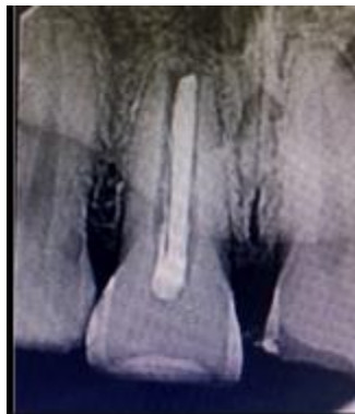
Figure 1 Preoperative radiograph showing previously root filled teeth with open apex in 11

The previous interim restoration was taken out, and the access cavity of 11 was modified with an endo access bur under the rubber dam isolation. The gutta percha was removed with the help of Protaper retreatment files (Dentsply Maillefer, Ballaigues, Switzerland) and a 60 size H-file (Mani INC; Japan) with the aid of solvent. A radiograph was taken to ensure the complete removal