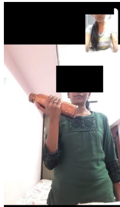
Figure 4 Patient performing upper limb strengthening exercise under the supervision of physiotherapist via telerehabilitation

the patient. Gradually the weight was increased to 1 L. Tele rehabilitation was given thrice every week. Remaining days, the patient was instructed to do the exercises by herself. Stretching included major muscle groups of the upper and lower body with 15 seconds hold repeated for 3 times. The online rehabilitation was given for about 4 weeks. The progression of the patient's condition was recorded on outcome measures mentioned below (Table 2).