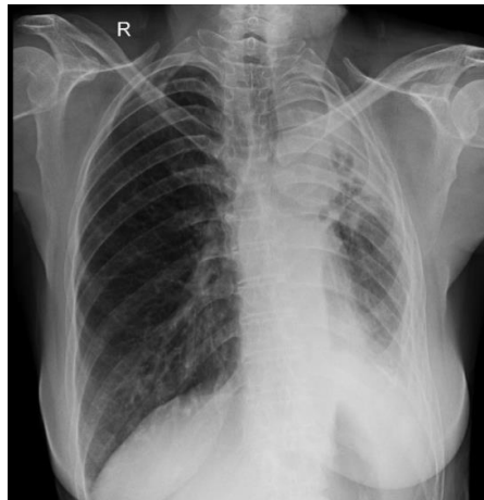
Figure 1 X-ray of chest which is showing homogenous opacity all over the left lung field with prominent bronchi-vesicular margins on the right side.