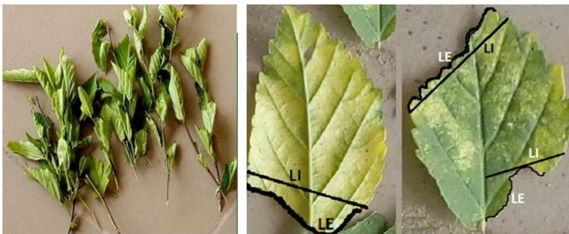
Figure 5: Sample of neatly cut grass stalks mowed by machine and leaf damage level