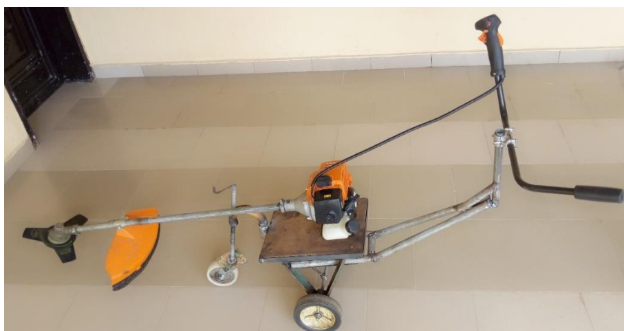
Figure 3: The modified experimental machine

The machine comprises of two major units: the machine and the carrier. The machine consists of a power unit, a control unit, the cutter head assembly and the guide. The carrier consists of two rear roller wheels and a 360° adjustable front roller assembly.