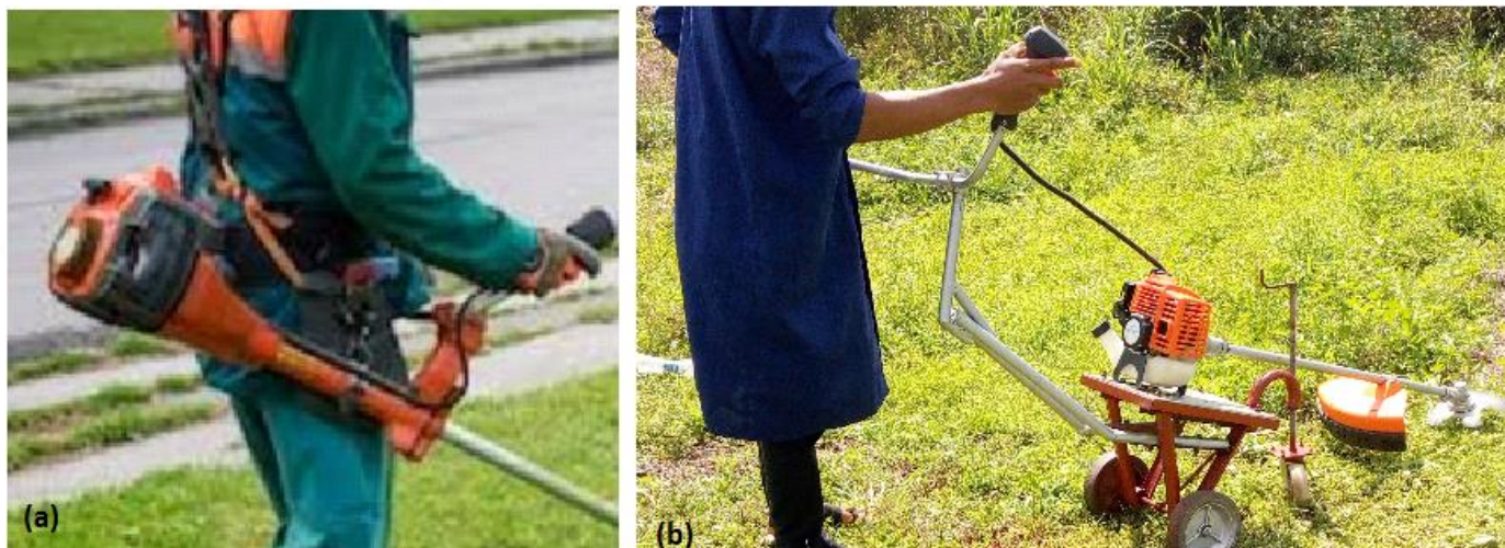
Figure 4: Field tests (a) Shoulder mounted, (b) Modified machine

The carrier: the carrier is a 372mm by 82mm flat board made from hard wood fitly inserted into a rectangular iron frame constructed from ½ inch angle iron. The board is mounted on two wheels supported on a spindle with open end tread. The spindle is supported by two ball bearings. The wheel assembly is connected to the engine platform using two wheelbarrow supports.