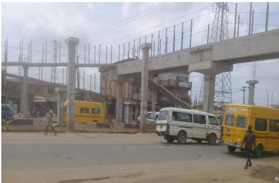
Plate 2 pedestrian Bridge under construction at kola bus stop along the route under study