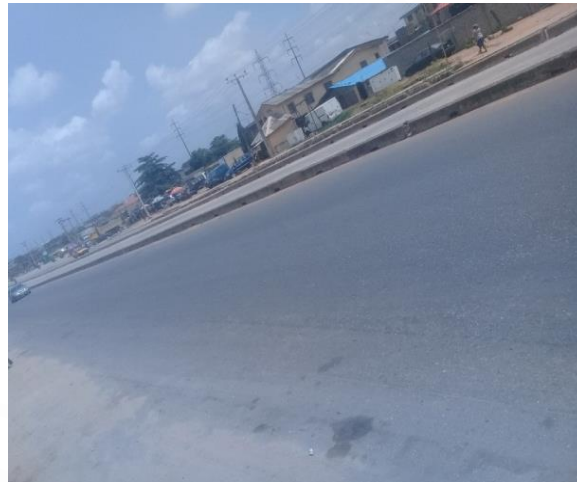
Plate 4 damage pavement along the study area