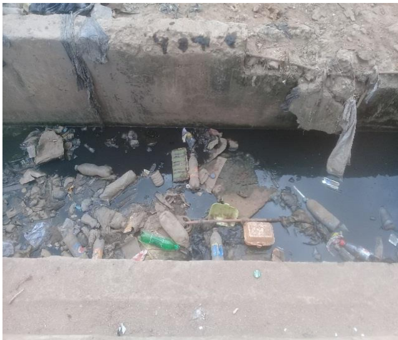
Plate 1 Bad drainage at Kola along Lagos- Abeokuta Express way

The plate 1 shows bad drainage at kola, plate 2 shows a pedestrian bridge that is currently undergoing construction, also plate 3 shows pot holes as a result of lack of drainage in that portion of the corridor while plate 4 shows a well paved road at iyana-ipaja.