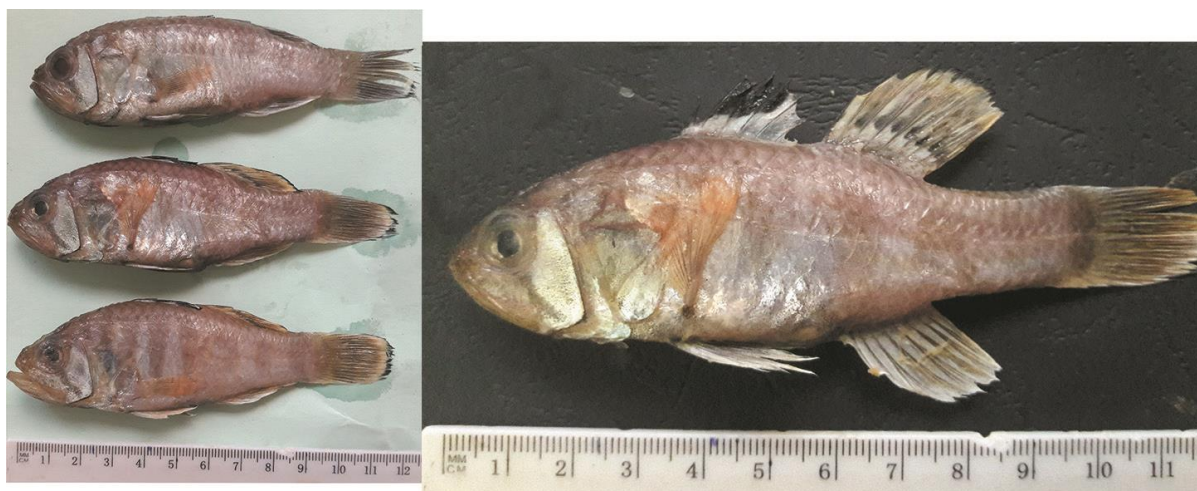
Figure 2 Jaydia smithi specimens caught on 18-9-2019 from Banyas coast-Syria.