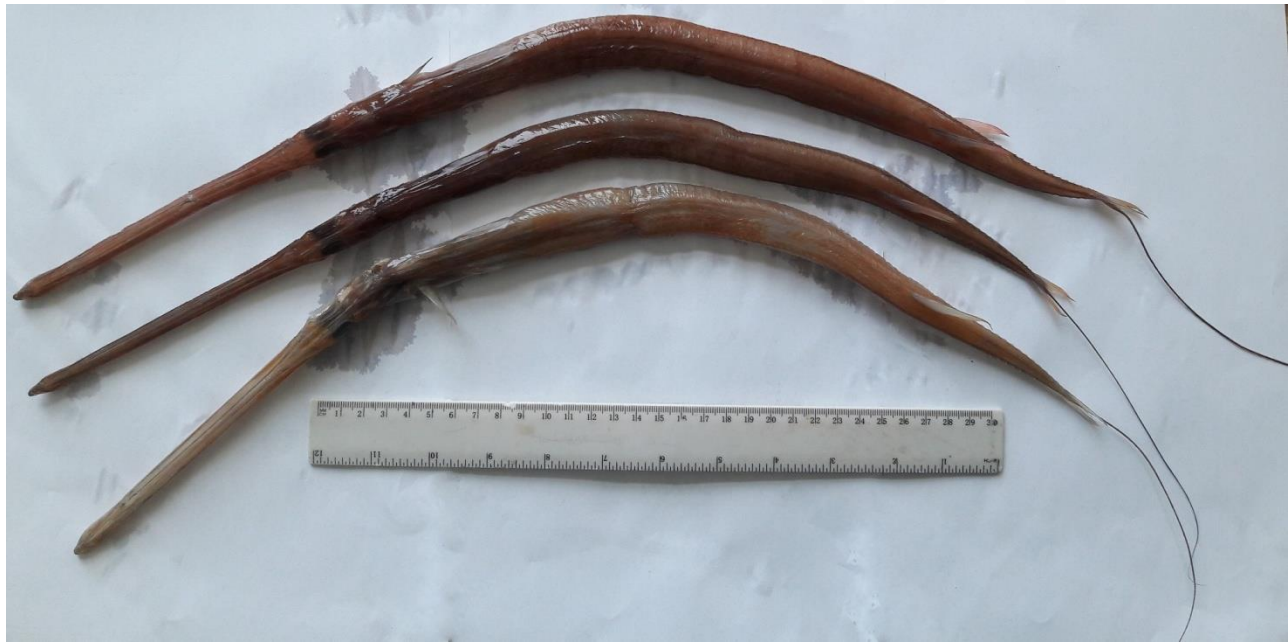
Figure 2 F. petimba specimen, caught on 24, 29/9/2019 from the Syrian coast

Two specimens of the red cornet fish Fistularia petimba Lacepède, 1803 (Fig2) were caught at ~ 45 m water depth off Lattakia coast, and one specimen was caught at ~30 m water depth off Banyas coast. They have long and lightly compressed body, long tubular snout and small mouth. The dorsal fin has soft rays and located approximately at the end of the body, and the caudal fin is clearly forked and has one elongated filament (Fig 2). The dorsal side of the body has a row of bony plates (Fig 2) stretching along to the end. The posterior part of the body has a series of backward-pointing spines on each side (Fig 2). The body is orange-brown and the abdominal side is pearly white. The margins of dorsal, anal and caudal fins are bright orange. The meristic formula was: D,15;A,15;P,15;V,6; C,7. These features of F. petimba are in full agreement with Carpenter and De Angelis (2016) and Ünlüoğlu et al. (2018). The morphometric measurements are shown in Table (1).