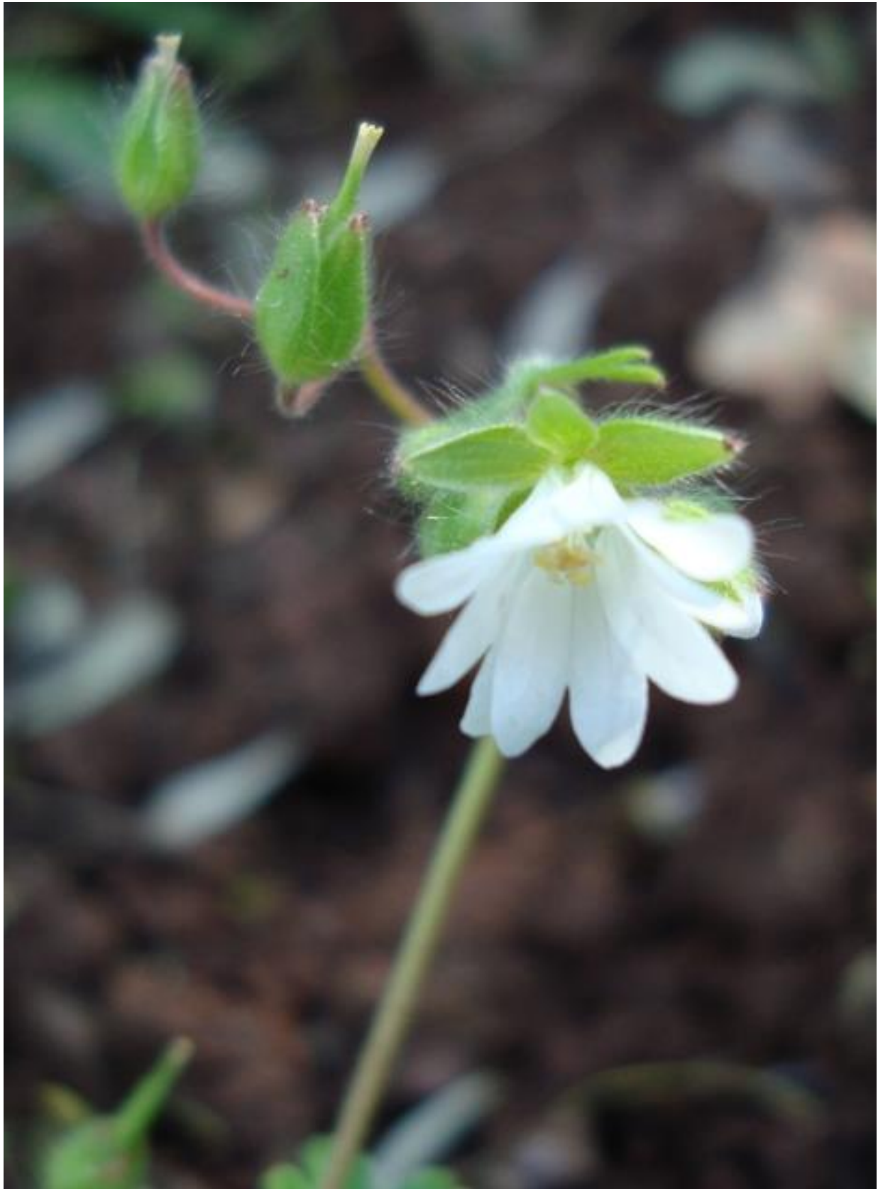
Figure 4 Geranium molle var. album , Flower