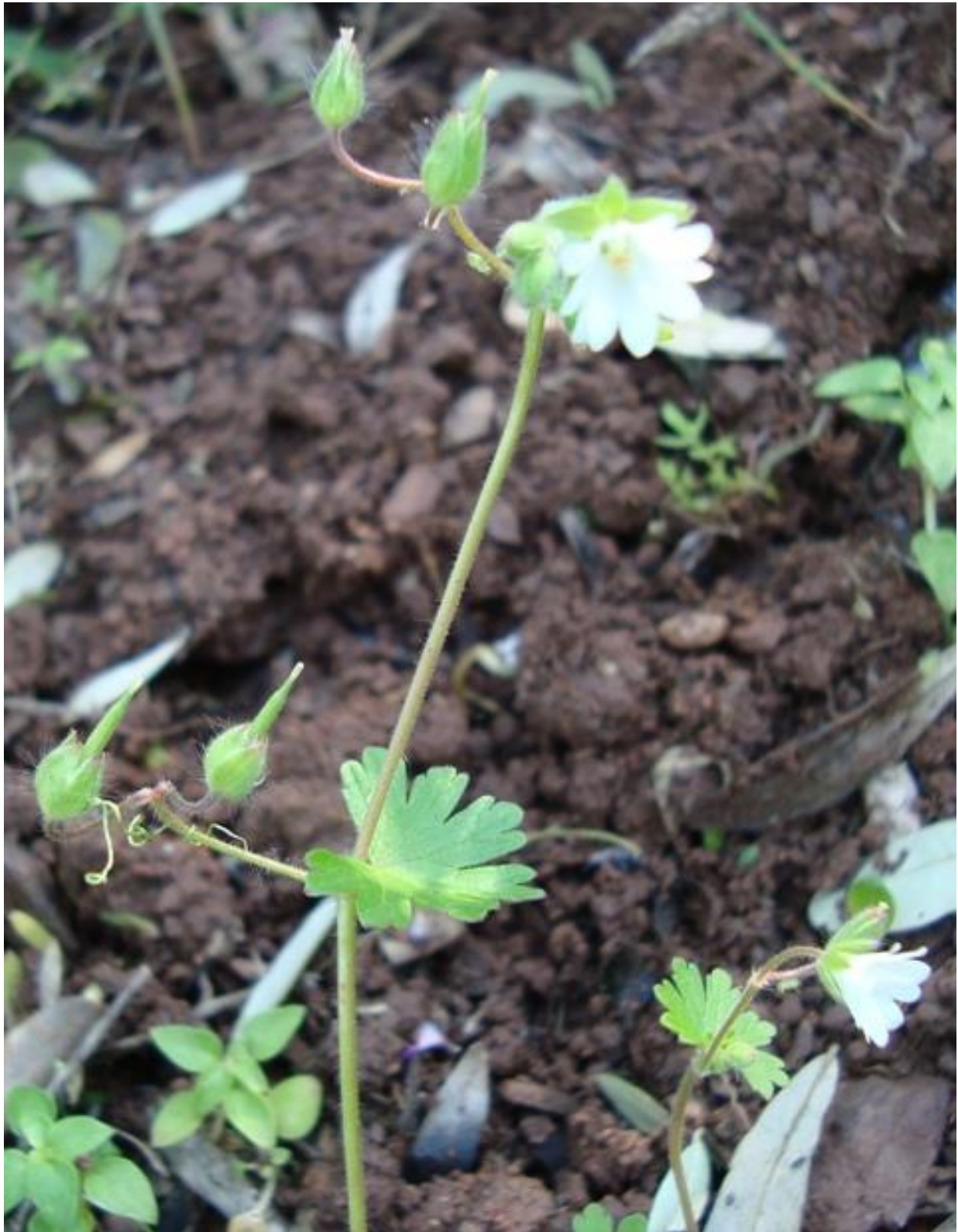
Figure 3 Geranium molle var. album , Habit.