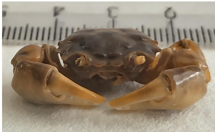
Figure 3 Anterior view of Brachynotus atlanticus Forest, 1957 from Syrian coast.