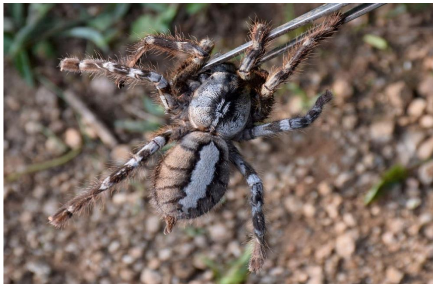
Figure 1 Poecilotheria hanumavilasumica Smith, 2004 in life

Poecilotheria hanumavilasumica Nanayakkara et.al. 2015: 3, f.3-4, 5 A-C.